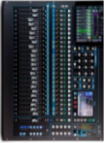
Mixer and wireless monitors just off stage

Harriet also has a wired Mic for songs when she sings lead vocals